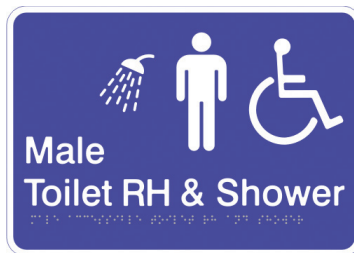
Male Accessible Toilet RH & Shower / CTA82-RH Size: 270 x 190 x 1.6