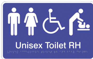
Unisex Accessible Toilet RH & Baby Change / CTA92-RH Size: 300 x 190 x 1.6