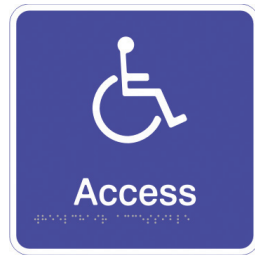
Accessible Wheel Chair / CTA37-AC Size: 190 x 190 x 1.6