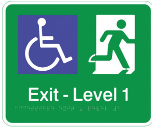
Accessible Fire Exit Level X / CTA155-X Size: 230 x 190 x 1.6