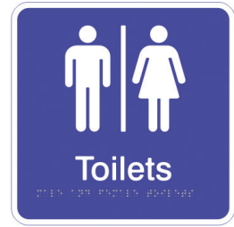
Separate Male / Female Toilets / CTA151 Size: 190 x 190 x 1.6