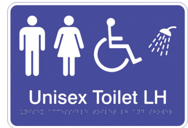
Unisex Accessible Toilet LH & Shower / CTA35-LH Size: 270 x 190 x 1.6