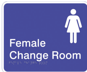
Female Change Room / CTA09 Size: 230 x 190 x 1.6