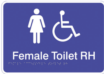
Female Accessible Toilet RH / CTA05-RH Size: 270 x 190 x 1.6