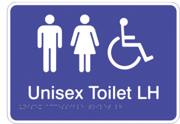
Unisex Accessible Toilet LH / CTA11-LH Size: 270 x 190 x 1.6