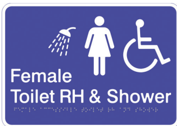
Female Accessible Toilet RH & Shower / CTA81-RH Size: 270 x 190 x 1.6