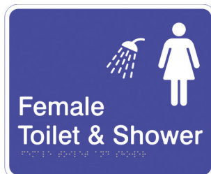
Female Toilet and Shower / CTA65 Size: 230 x 190 x 1.6