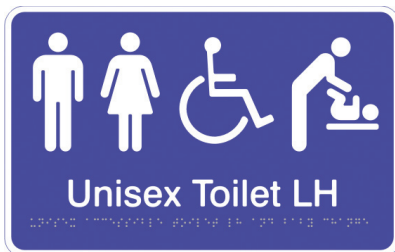
Unisex Accessible Toilet LH & Baby Change / CTA92-LH Size: 300 x 190 x 1.6