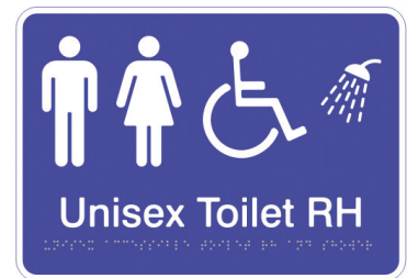
Unisex Accessible Toilet RH and Shower / CTA35-RH Size: 270 x 190 x 1.6