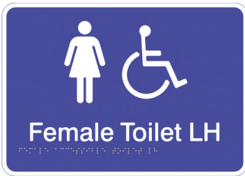
Female Accessible Toilet LH / CTA05-LH Size: 270 x 190 x 1.6