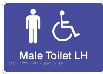
Male Accessible Toilet LH / CTA06-LH Size: 270 x 190 x 1.6