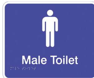
Male Toilet / CTA02 Size: 230 x 190 x 1.6