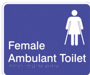
Female Ambulant Toilet / CTA52 Size: 230 x 190 x 1.6