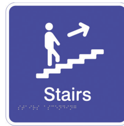
Stairs Ascending / CTA153 Size: 190 x 190 x 1.6