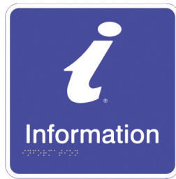
Information / CTA150 Size: 190 x 190 x 1.6