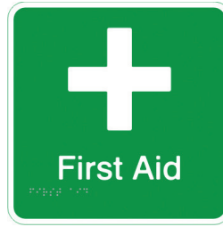
First Aid / CTA077 Size: 190 x 190 x 1.6