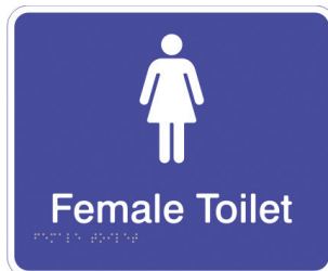
Female Toilet / CTA01 Size: 230 x 190 x 1.6

Product Installation, list of Approved Products and Material Safety Data Sheets are available upon request.