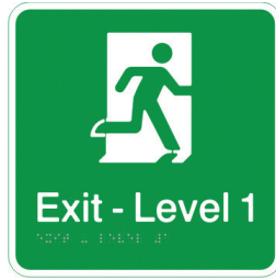
Fire Exit Level X / CTA107-X Size: 190 x 190 x 1.6