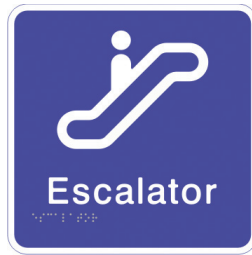
Escalator / CTA158 Size: 190 x 190 x 1.6