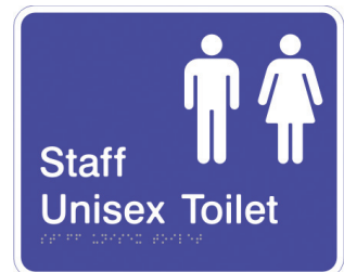
Unisex Staff Toilet / CTA42 Size: 230 x 190 x 1.6