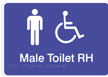
Male Accessible Toilet RH / CTA06-RH Size: 270 x 190 x 1.6