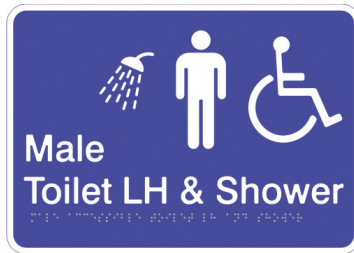
Male Accessible Toilet LH & Shower / CTA82-LH Size: 270 x 190 x 1.6