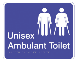
Unisex Ambulant Toilet / CTA54 Size: 230 x 190 x 1.6