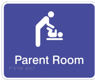
Parent Room / CTA156 Size: 230 x 190 x 1.6