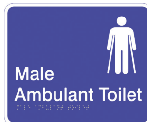
Male Ambulant Toilet / CTA53 Size: 230 x 190 x 1.6