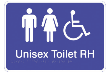
Unisex Accessible Toilet RH / CTA11-RH Size: 270 x 190 x 1.6