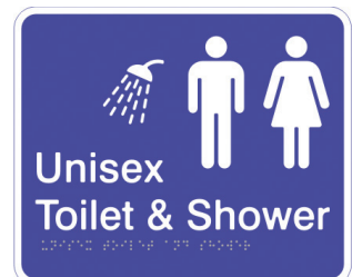
Unisex Toilet and Shower / CTA98 Size: 230 x 190 x 1.6

CALL CTA ON 1300 282 282 TO ARRANGE A MEETING WITH A SALES CONSULTANT