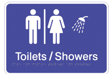
Separate Male / Female Toilet and Showers / CTA160 Size: 270 x 190 x 1.6

CALL CTA ON 1300 282 282 TO ARRANGE A MEETING WITH A SALES CONSULTANT