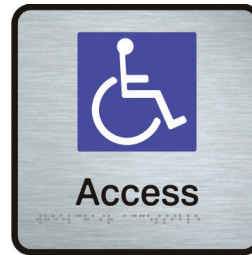
Accessible Wheel Chair / CTA37-AL Size: 190 x 190 x 1.6