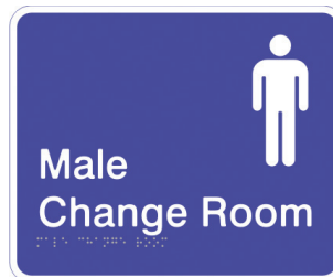
Male Change Room / CTA10 Size: 230 x 190 x 1.6