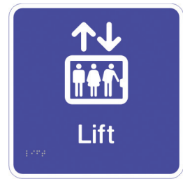
Lift / CTA157 Size: 190 x 190 x 1.6