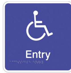
Accessible Entry / CTA159 Size: 190 x 190 x 1.6