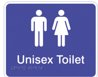
Unisex Toilet / CTA03 Size: 230 x 190 x 1.6