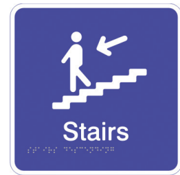
Stairs Descending / CTA154 Size: 190 x 190 x 1.6