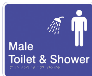
Male Toilet and Shower / CTA64 Size: 230 x 190 x 1.6