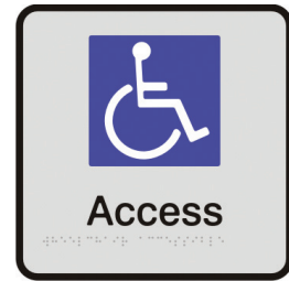
Accessible Wheel Chair / CTA37-SS Size: 190 x 190 x 1.6