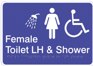
Female Accessible Toilet LH & Shower / CTA81-LH Size: 270 x 190 x 1.6