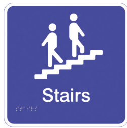
Stairs / CTA152 Size: 190 x 190 x 1.6