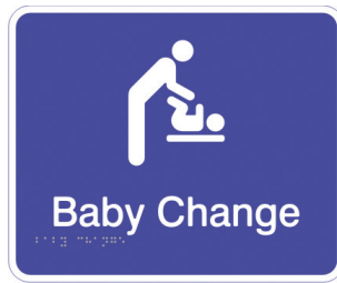
Baby Change / CTA72 Size: 230 x 190 x 1.6