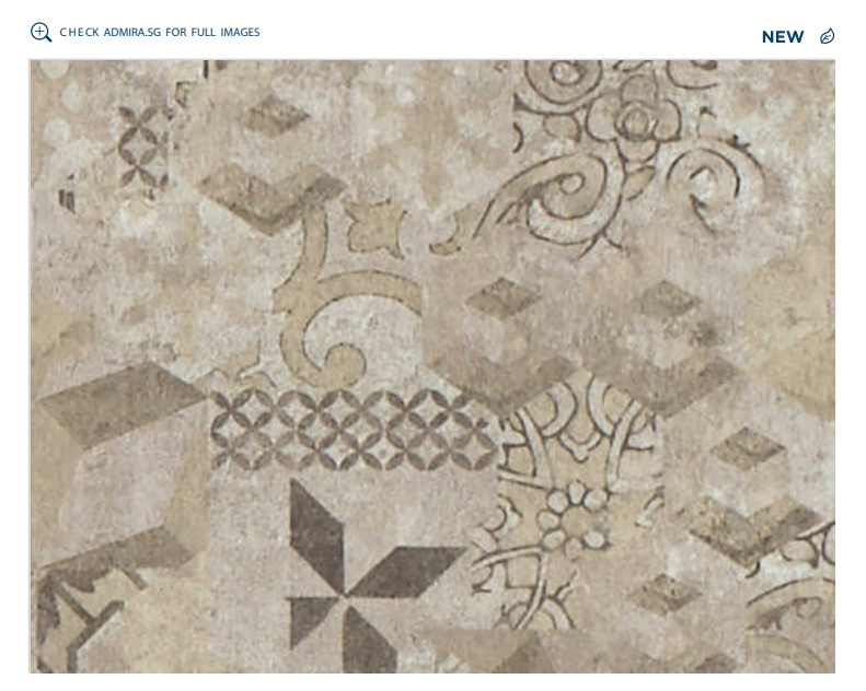
JAG 1284 PY