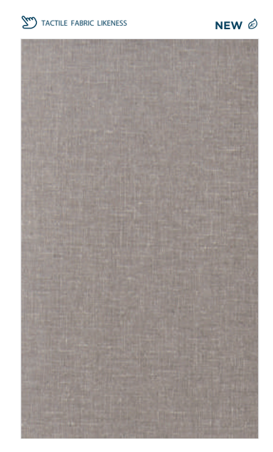
GREY RASEN JBG 4171 FB