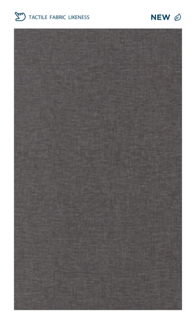
GREY RASEN (DARK) JBG 4172 FB