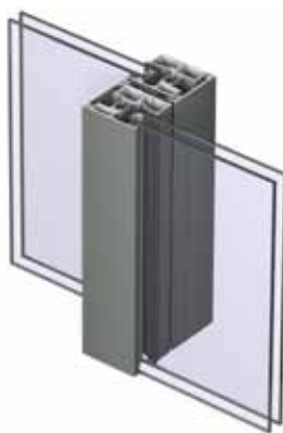
Slimline middle section